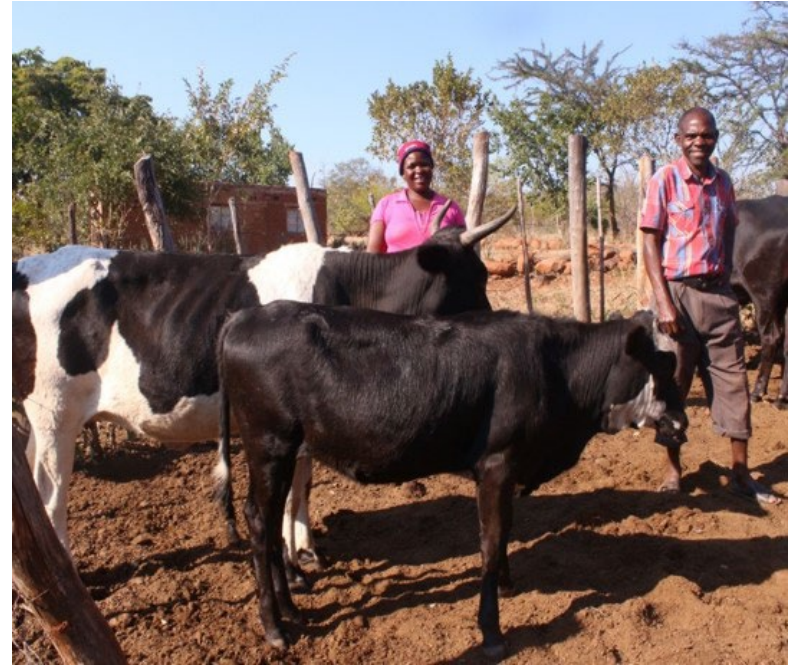
Mrs. Masasi showing the cow she bought using savings groups funds