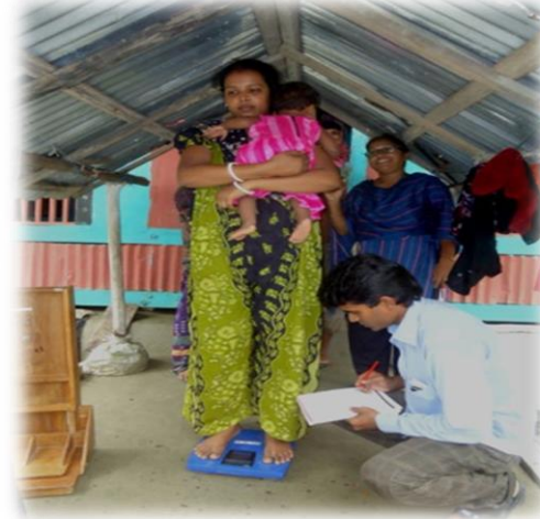
Annual monitoring survey in ground (Anthro measurement)