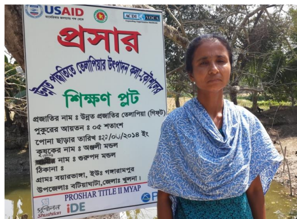
HH observation as a part of regular IDQA