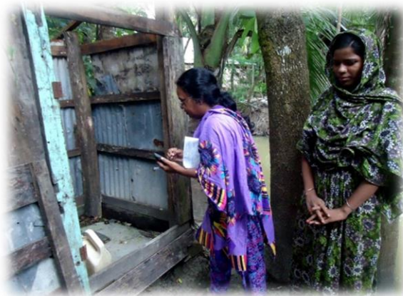
HH observation as a part of Annual Monitoring survey