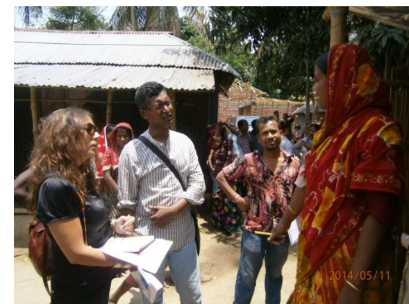
IDQA conducted jointly ACDI/VOCA HQ & PROSHAR M&E jointly at PNGOs level