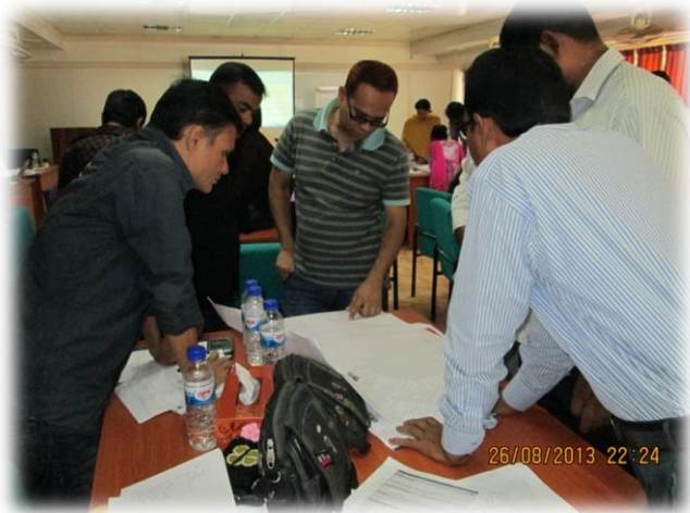
Training of enumerators