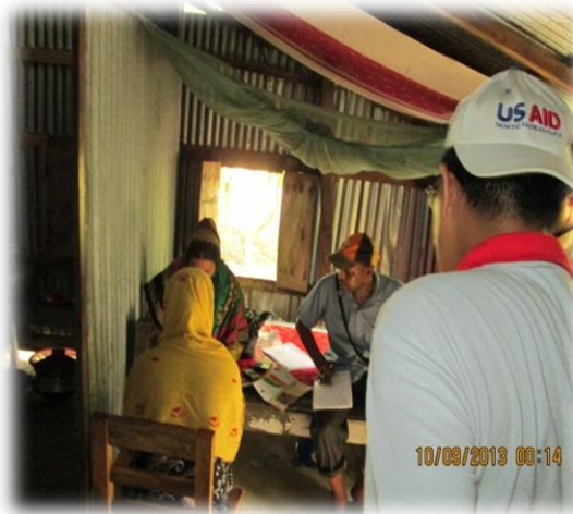
USAID staff in DQA process