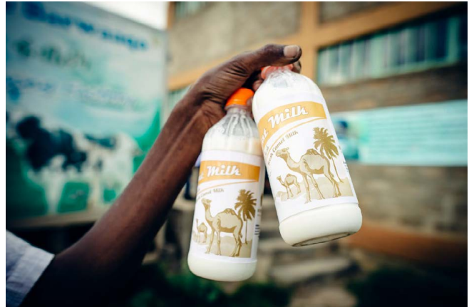
Sean Sheridan / Mercy Corps

In March 2020, governments across the Horn of Africa established mitigation measures to prevent the spread of COVID-19. Initial measures included suspending international flights, closing international borders and limiting gatherings of large groups of people. Closure of international borders along with suspension of night-time travel has resulted in bottlenecks and delays in the movement of goods including animal health inputs, raw ingredients for animal feed (maize, soya, imported supplements), and live animals; resulting in higher operating costs for traders and increased prices for retailers and processors. 2 The sequencing and timing of more stringent mitigation measures varied by country, but the closure of markets and localized movement restrictions, and the subsequent loss of jobs and income caused by these restrictions, created severe economic impacts across all countries. Ethiopia is projected to lose close to 10 million jobs in the private sector, inclusive of the self-employed and employees of small and medium-sized enterprises (SMEs). Additionally, household and business spending in Kenya has reduced by 50 percent due to lost income and revenues. 3