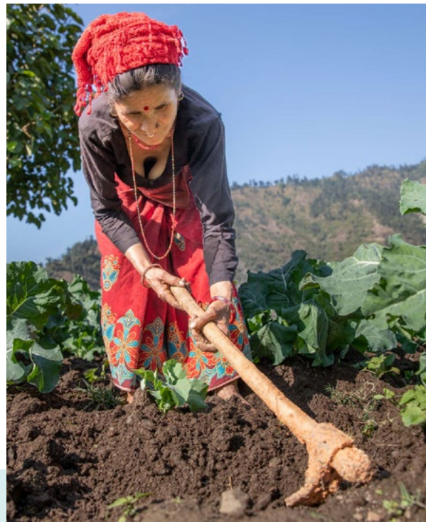
BHAKARI, Nepal

Based on feedback from stakeholders involved in this phase, co-creation between BHA and the broader USAID team, the implementing team, and other USAID partners was important in developing the multi-year activities. In South Sudan, one interviewee noted, “they had seven to eight participants from the USAID Mission involved in the co-creation, plus substantial representation and resources.” The United Nations World Food Programme (WFP) and the Food and Agriculture Organization (FAO) were also involved in the process, agreeing to provide humanitarian food assistance and agricultural inputs as needed. By bringing actors together in a design workshop, BHA and implementing partners co-created an initial foundation for multi-year risk reduction and resilience programming. However, while the design workshop identified other actors to support interventions by providing additional resources during a crisis, the planned assistance was not always implemented. In future, where co-creation includes specific responses