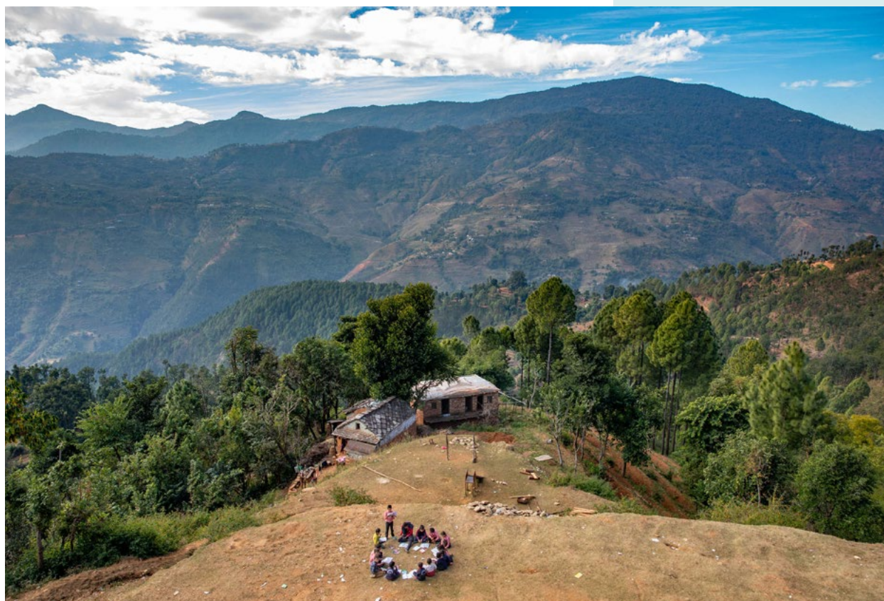
Participants in the BHAKARI activity.