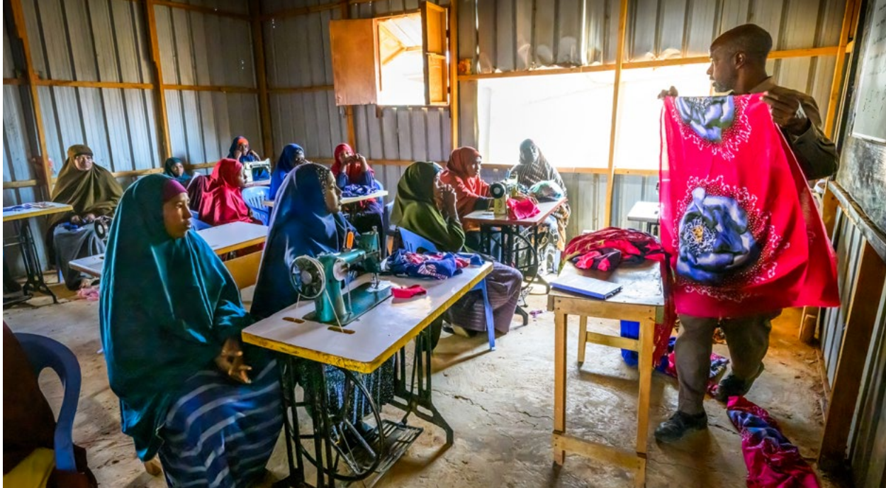
WVI - UPC Baidoa, Somalia

IDPs find hope in vocational skills training.