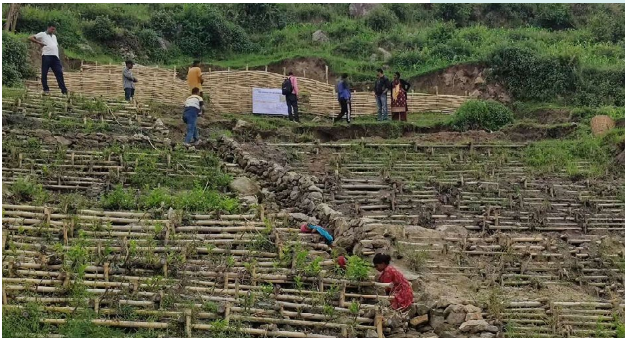
Participants in the BHAKARI activity.

The analysis emphasized drawing comparisons across countries and perspectives to identify overarching trends and factors that contribute to the successes and challenges of multi-year humanitarian programming. IDEAL then cross-referenced and validated this information with the desk review.