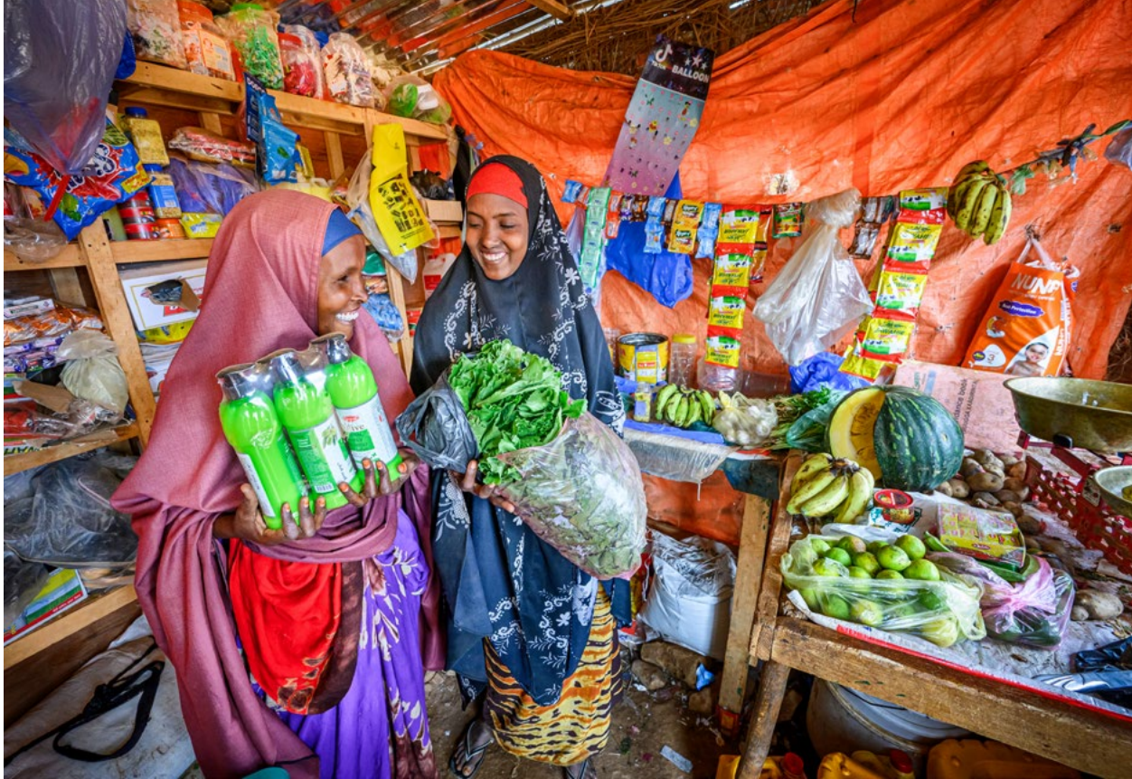
WVI - UPG Baidoa, Somalia

A Saving for Transformation (S4T) group doing business in Baidoa, Somalia.