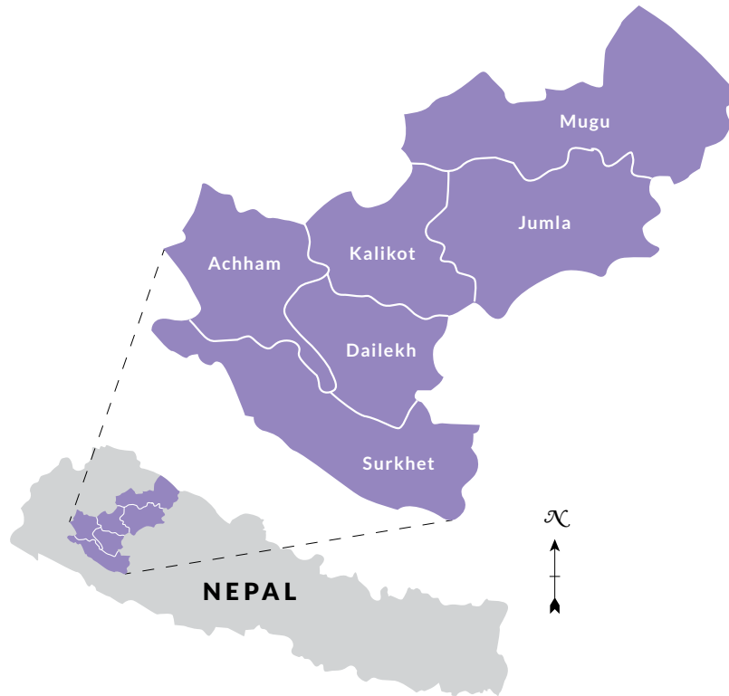
Map of Nepal; implementation area of the BHAKARI activity.