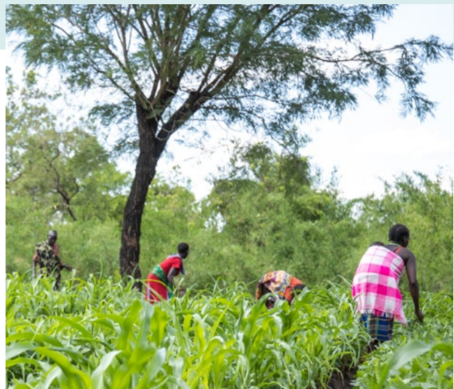
CRS, P2R, South Sudan

Members of a farmer producer group weed their crops under a drip irrigation system provided by CRS in Budi County, South Sudan.