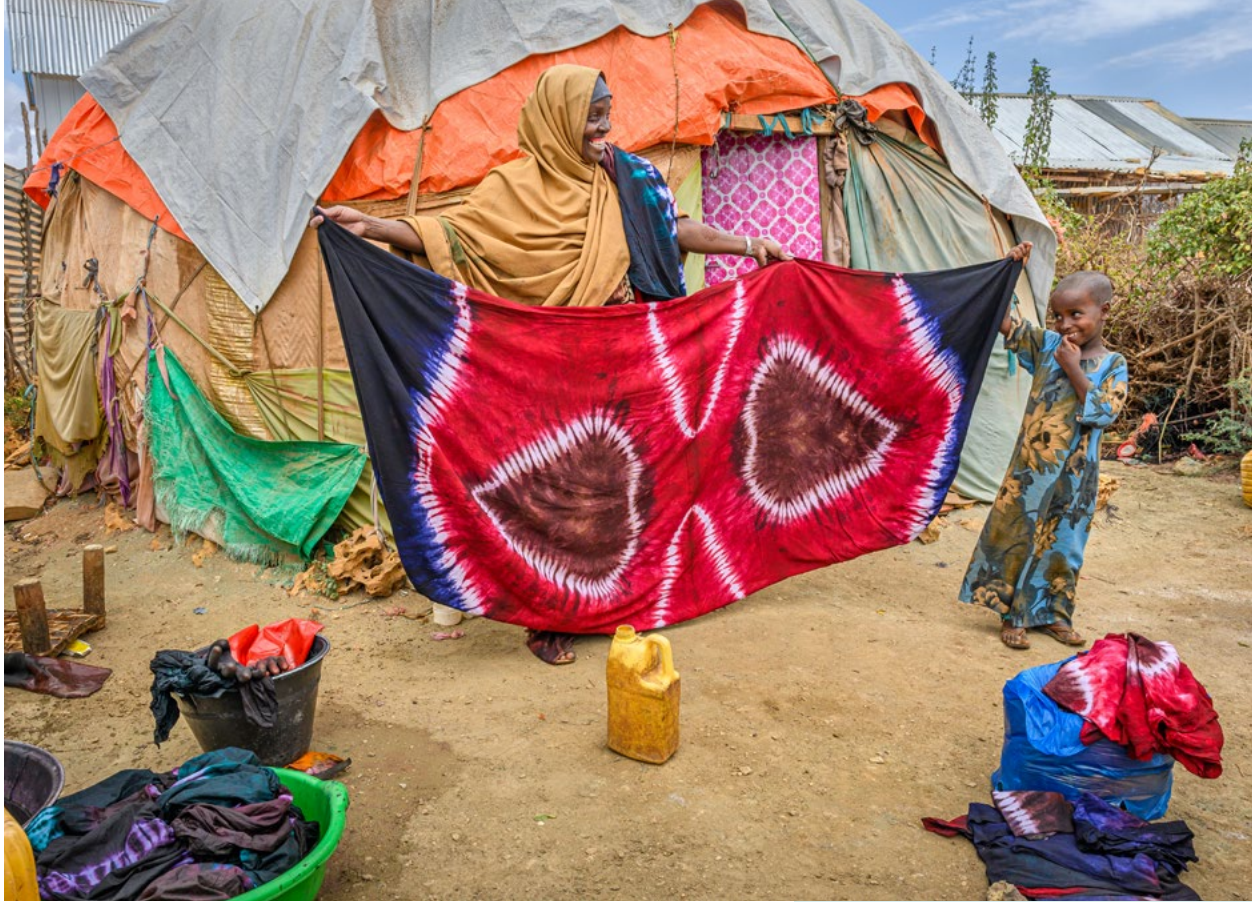
WVI - UPG Baidoa, Somalia

Tie dye vocational training for IDP mothers.