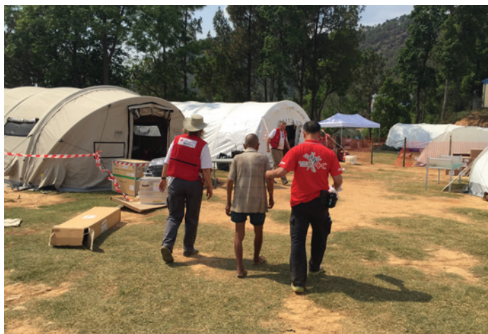
In Nepal, earthquake preparedness saved lives – and limbs.

assessment of risk and the intervention should seek to reduce immediate and future risks” (DG ECHO 2014, p.16).