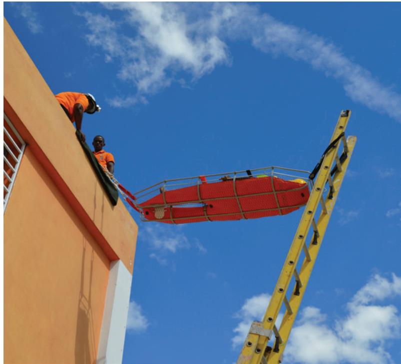
Civil Protection and Red Cross volunteers trained under the Disaster Preparedness programs funded by DG ECHO perform a rescue operation, Haiti.

DG ECHO views preparedness as being critically important for the quality and timeliness of response operations, as well as being a way of improving anticipation, thus complementing humanitarian assistance in saving lives, reducing suffering and pre-empting or decreasing humanitarian needs. DG ECHO recognises that disaster preparedness applies to all forms of risk, ranging from natural hazards and epidemics to human-induced threats such as conflict and violence. Understanding and anticipating such risks is essential in order to define the needs that they might generate and to design and implement effective preparedness actions and response operations. All humanitarian action therefore needs to be informed by risk assessment and analysis, which should consistently complement a needs-based approach.