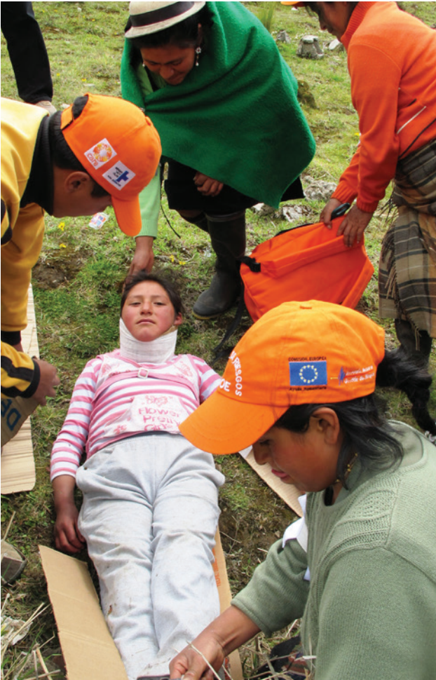
Members of the local civil protection committee benefited from disaster preparedness activities to help them prepare and respond to future natural events in South America.

Additional support, in particular to respond to identified gaps in the areas of transport and logistics, is made available via the Union Civil Protection Mechanism and DG ECHO's 24/7 Emergency Response Coordination Centre (ERCC).