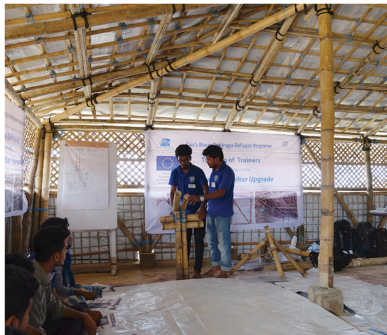
In Bangladesh, disaster preparedness, disaster risk reduction and resilience have been priority areas of EU-funded interventions. Communities have been trained to prepare for potential hazards.