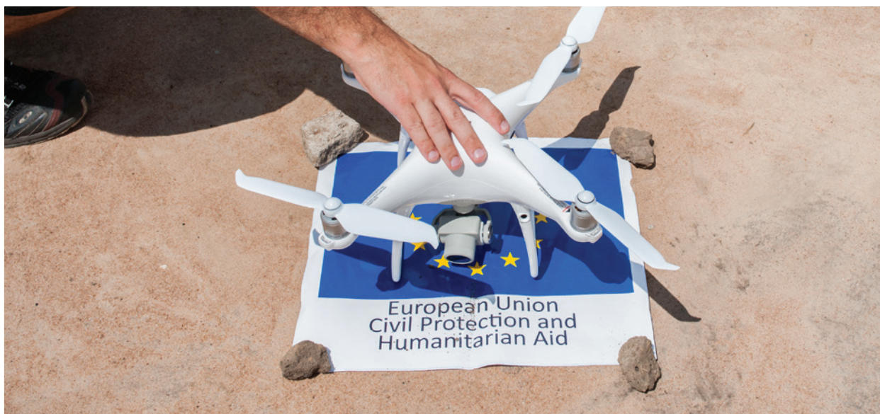
Drones are used in the Sofala province to map the extent of the damage after cyclone Idai, in Mozambique.

A regular challenge is the disconnect between data availability and analysis, decision-making and anticipation or response. Thus, in order for humanitarian stakeholders or national/local authorities to be ready to effectively deploy data tools before a crisis, the focus must be placed also on data preparedness . In other words, it is important to ensure that the evidence needed to inform a response will be available quickly enough. Readiness of data means, for example, improving the coordination of data collection among local organisations for key datasets, such as historical impact data for early warning systems. At-risk communities must be involved throughout data collection and analysis, both as a source of information, and also to ensure that first responders have the information that they need to act effectively.