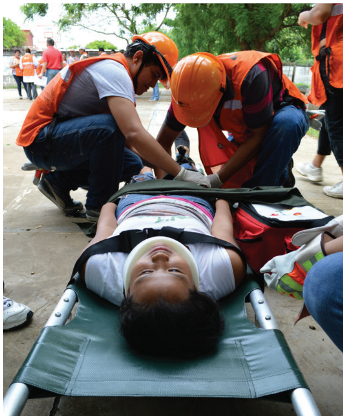
Local brigades who have received capacity building assistance as part of a disaster preparedness project implemented by DG ECHO's partner ACSUR-Las Segovias perform a rescue operation during a drill in Managua.

Target population and area(s): the target population/area(s) are generally those indicated in the action, whether this is a response or targeted preparedness action. However, for response operations, it is possible to use a CM for other population groups/geographical areas, provided that the partner has the capacity to scale up and respond. In the case of targeted preparedness actions 77 , the CM should be used to respond to a sudden crisis if related to the focus/target population and area of the action, and if the partner has the capacity to do so. Exceptionally, a CM can be used