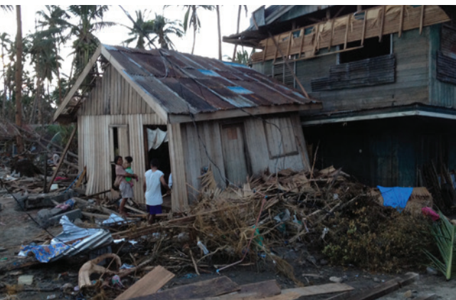
In the Philippines, cyclones and typhoons are so frequent that structural damage like this needs to be repaired before the next typhoon hits.

level rise, coastal erosion, salinification of groundwater, etc.) 48 . It is also threatening people's ability to maintain weather-dependent livelihoods (e.g. farming, herding or fishing). This could jeopardise the effectiveness of interventions themselves. As such, and in line with the risk-proofing approach discussed in Chapter 3, the climate resilience of preparedness and response interventions should be ensured from the outset.