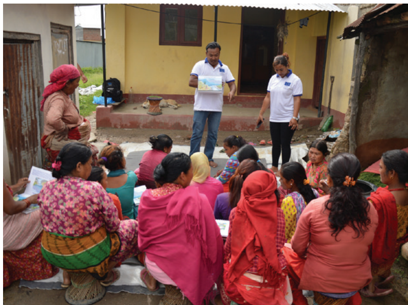
Nepal: 3 years after the earthquake, DanChurchAid conducts regular awareness sessions on Disaster Risk Reduction with local communities

The 2021 renewed DG ECHO DP approach recognises and builds on the multiple strengths of the DIPECHO programme and its pioneering role in supporting disaster preparedness via a community approach, by linking community-based approaches with national and regional systems. It also provides guidance on how to implement evaluation recommendations and improve coherence and effectiveness.