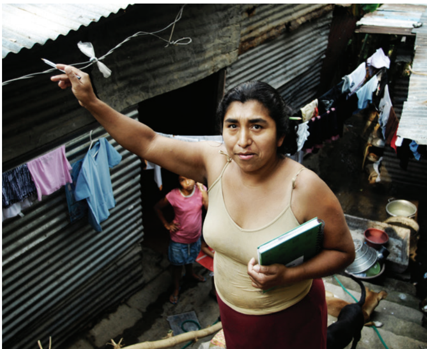
This woman lives in a slum area in El Salvador where a disaster preparedness DG ECHO project (DIPECHO) is trying to improve the way these vulnerable communities can react in the face of a disaster.

DG ECHO recognises that good professional practice in S&S incorporates many, if not most aspects of DRR. Accordingly, DG ECHO requires that humanitarian interventions in S&S are designed and implemented by agencies who have the requisite technical competence in the specific areas of shelter covered.