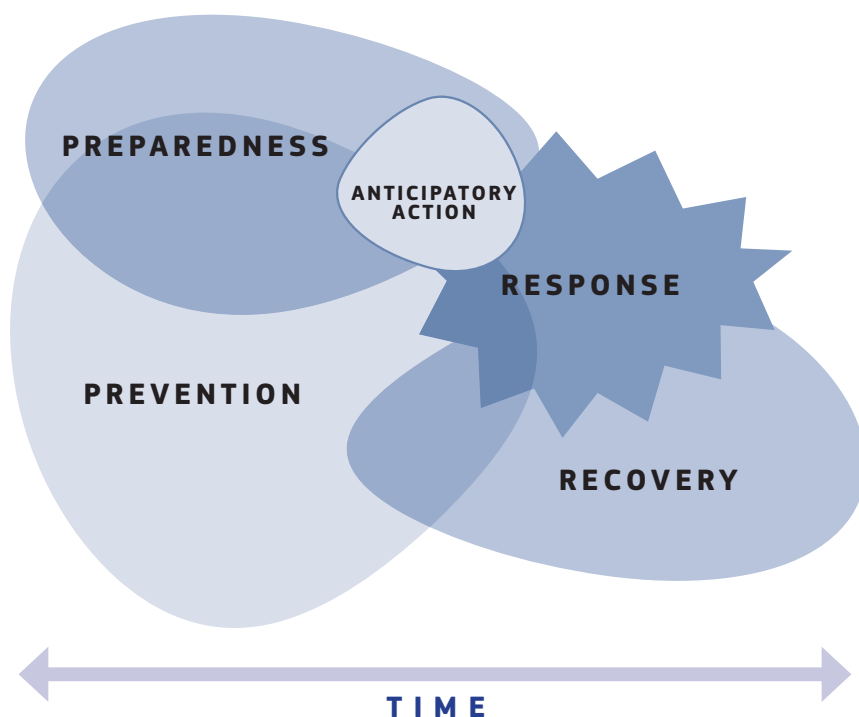
Graph 1. Risk management strands

These strands are closely connected and overlapping, as illustrated in the graph below.