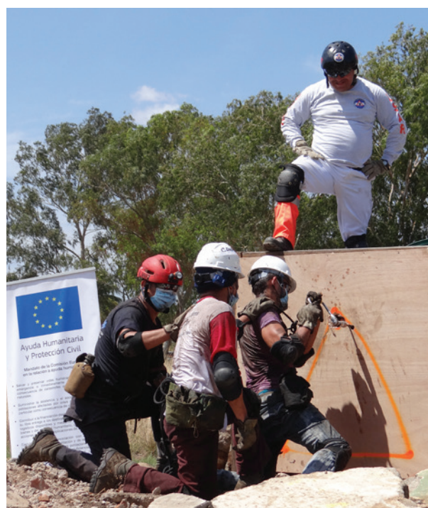
This is a drill in which recently trained brigades perform rescue operations saving people from collapsed buildings during a fire in Nicaragua's capital Managua.

“ Considering the unfolding climate and environmental crisis, analysis of current and future risks stemming from both climate change and environmental degradation should be included in all risk assessments to identify interlinkages and priorities for action in specific contexts. ”