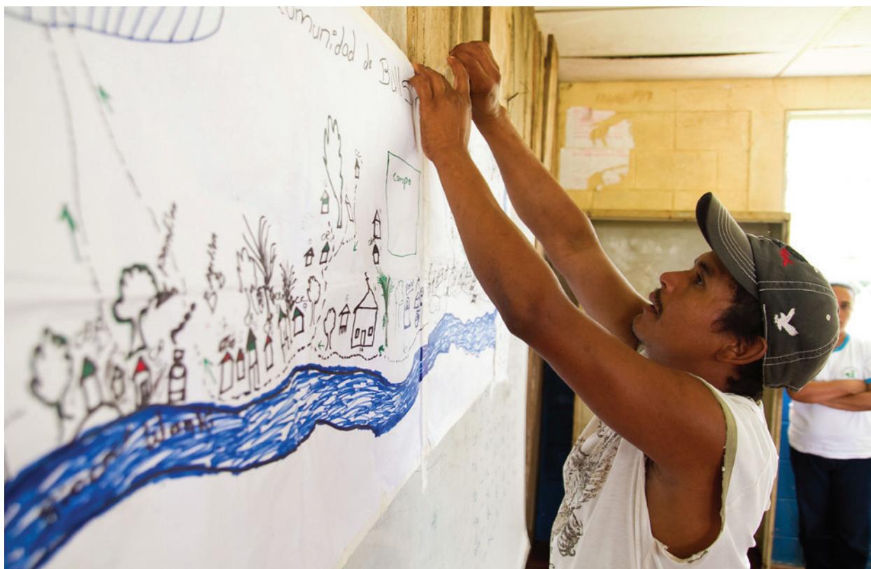
Mapping risks in remote Bull Sirpi.

A key consideration to improve efficiency in logistics is that of stockpiles of relief goods, ideally prepositioned and available in sufficient quantity so that time and expenses are minimised in responding to an emergency. Additionally, impact and efficiency may be improved through, for example, joint ventures in procurement, transport, storage and delivery of goods, including the provision of common services (for instance, by standardising them or by signing standard pre-agreements with potential service providers), and/or the pooling of assets. Where contexts allow, cash transfers should be used as an effective modality for the delivery of assistance and to help reduce logistics challenges for humanitarian actors (for more on cash transfer and preparedness, please refer to section 6.6).