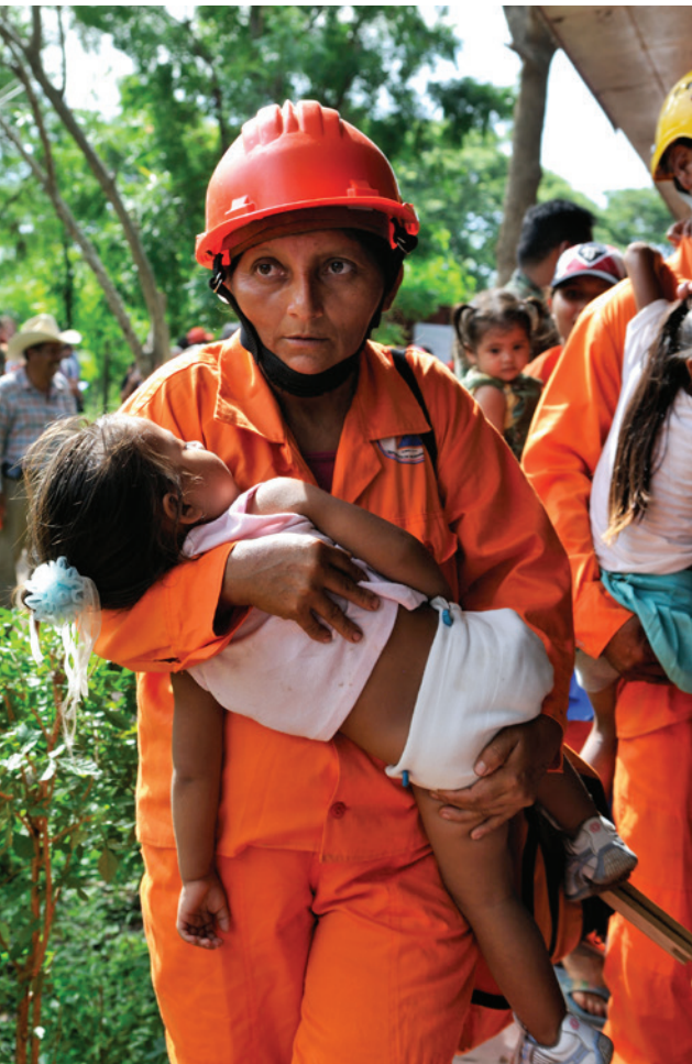
Preparing for disasters so they can save their communities

DG ECHO continues to support preparedness in fragile, violent and conflict-affected situations through increased foresight, but requires that humanitarian interventions in these situations are designed and implemented by agencies who have the necessary technical skills and have knowledge of socio-economic dimensions, conflict dynamics and the local environment. In contexts where it is not feasible or acceptable to work with the national system, it is possible to support a local system, for example a consortium of NGOs, or local co-ordination mechanisms who have a continuing presence in the location and are able to address preparedness capacity gaps. DG ECHO prefers to support networks and NGOs that are already in place, or that are able to have a continuous presence as this helps to produce consistent preparedness benefits, even after the project funding period, and avoids recurrent preparedness expenditure.