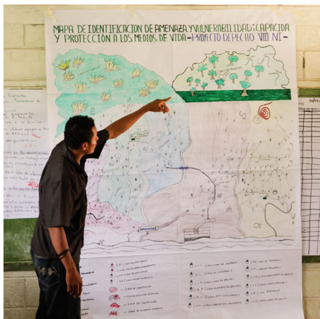
A resident of La Esperanza (Nicaragua) shows a map drawn by the community to define the areas most at risk, the safest spots and the threats to the village.

DG ECHO expects partners to actively coordinate on cash preparedness and contingency planning, under the leadership of the Cash Working Group and in coordination with key social protection actors. This should include joint feasibility and risk assessments. Unfortunately, strategic coordination of cash transfers is currently still ad-hoc as it does not fit into the humanitarian architecture. Predictable, accountable coordination of humanitarian cash remains a key challenge 45 . In line with DG ECHO's global disaster preparedness priorities (for the 2021-2024 priorities refer to Annex 3), the specific opportunities (e.g. market functionality, availability of digital transfer mechanisms) and challenges (e.g. targeting, stakeholder coordination) of cash preparedness in urban contexts should be considered.