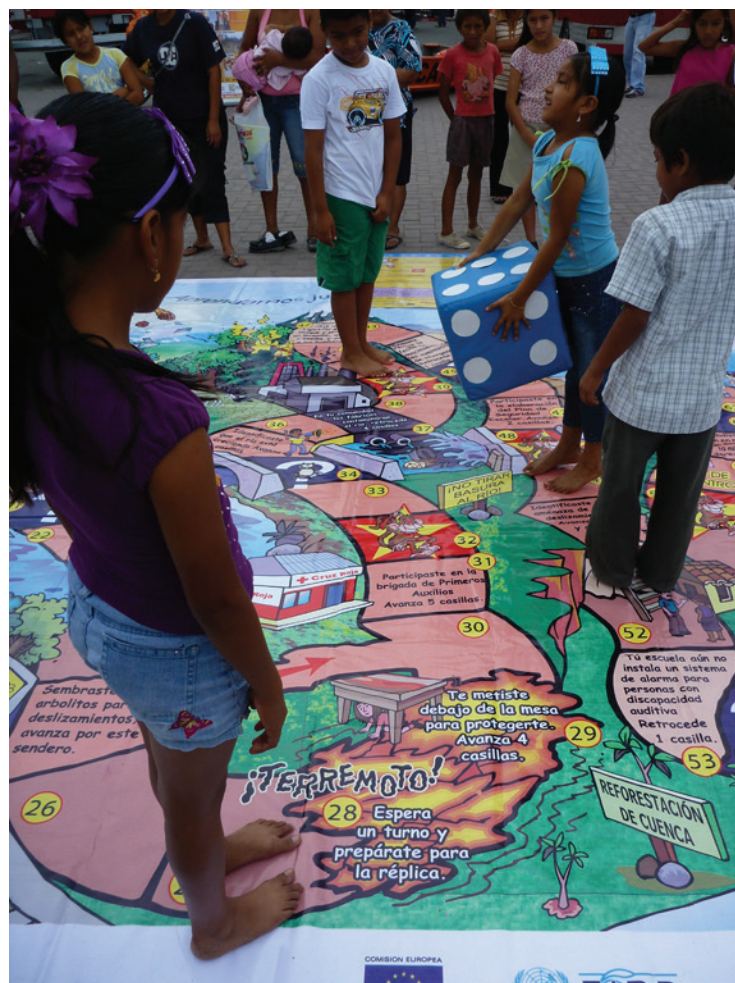
Children playing ISDR Disaster Risk sensitization game, a game that teaches children what are the risks faced by their community and how to best deal with them. Santa Elena province. Ecuador.

Advocacy and awareness-raising activities should have a clear objective and should be designed specifically for their intended audience. They can aim to leverage the potential of specific groups, such as the media or youth, to promote change. Advocacy and awareness-raising are closely intertwined and can use a variety of means, such as documents and petitions to promote accountability mechanisms, or the media (TV, radio, newspapers, social media), or demonstrations, public events, presentations in meetings and workshops, or lobbying decision-makers like politicians, government officials and other key actors. In order for advocacy and awareness-raising activities to be successful, they need to use a variety of means at different levels. They should equally be used as a way to increase knowledge about issues/rights and as a way to empower people and communities to act and express their concerns through activities such as community-led awareness campaigns (e.g. theatre, community radio, participatory videos) or the development of awareness materials (e.g. leaflets, posters, billboards, brochures, radio spots).