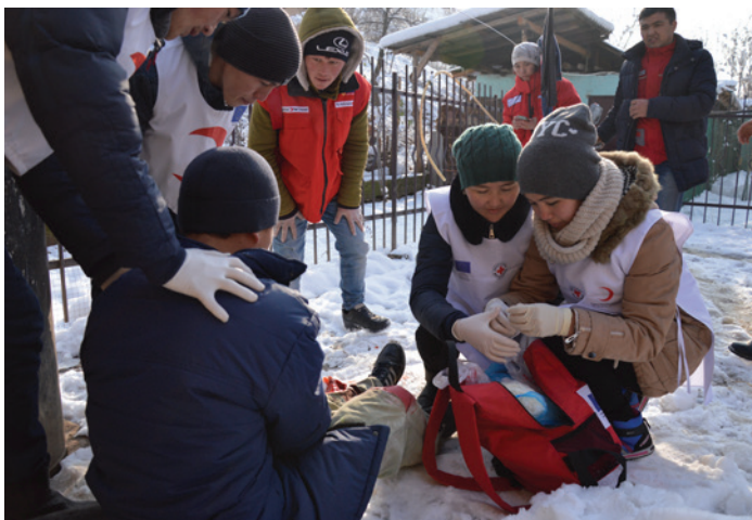
Simulating a full scale natural disaster in the mountains of Kyrgyzstan. Meanwhile, first aid teams are dispatched to different locations across the hamlet, where serious injuries have been reported.

Mainstreaming protection principles across all preparedness actions remains critical to anticipate, mitigate and respond to identified protection risks, and promote the safety and dignity of girls, boys and women and men of all ages. DG ECHO ensures that protection mainstreaming, which is the process of incorporating protection principles and promoting meaningful access, safety and dignity in humanitarian aid, is integrated in all funded actions. Protection mainstreaming is “an imperative for all humanitarian actors engaged in humanitarian response” (IASC Policy on Protection in Humanitarian Action, 2016) 57 . Protection is mainstreamed by incorporating protection principles such as meaningful access, participation and empowerment, accountability, and the prioritization of do no harm to promote safety and dignity in humanitarian aid. The meaningful mainstreaming of protection in preparedness is grounded in: a system-wide approach to all-risk assessment and analysis (for more details, please refer to section 3.2.1), which provides better understanding of the specific vulnerabilities and capacities of different affected groups in relation to specific hazards/threats; the effective and timely identification of tailored early actions to respond more effectively to specific protection risks; and the promotion of a protection-sensitive, and gender- and age-appropriate, and disability-inclusive approach.