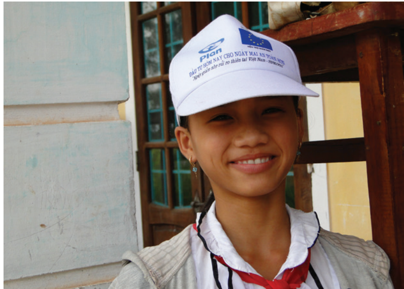
Vietnam: Schoolchildren participate in a Disaster Preparedness class organised by the NGO PLAN, funded by DG ECHO. © Cecile Pichon, June 2011, DG ECHO.

Finally, the Annexes 1 to 3 contain guidance on specific topics - namely, mainstreaming preparedness and risk reduction into response operations, crisis modifier and global priorities 2021-2024 for the DP Budget Line. Annex 4 contains a list of resources and tools to explore further the matters addressed in this document.