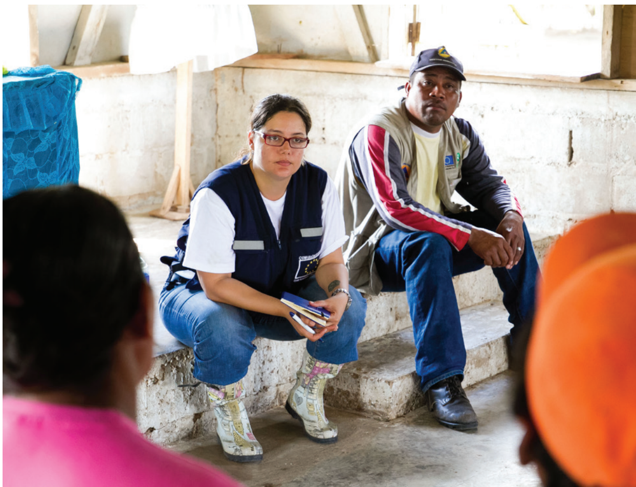
Women experts reaching remote communities in Nicaragua.

action. Risk reduction measures, however, remain relevant to every sector of humanitarian assistance. Before and during their implementation, it is important to consider the linkages between sectors. Further guidance on preparedness and risk proofing of response operations can be found in the humanitarian policies of DG ECHO, mentioned in section 2.2, as well as in Annex 1.