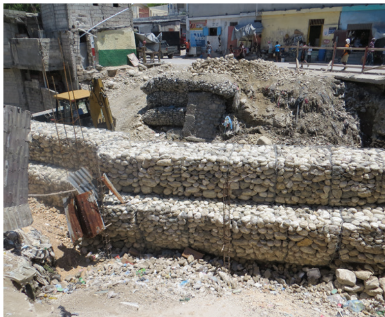
The EU funded Disaster preparedness programme in Haiti seeks to strengthen local capacities to face natural hazards.