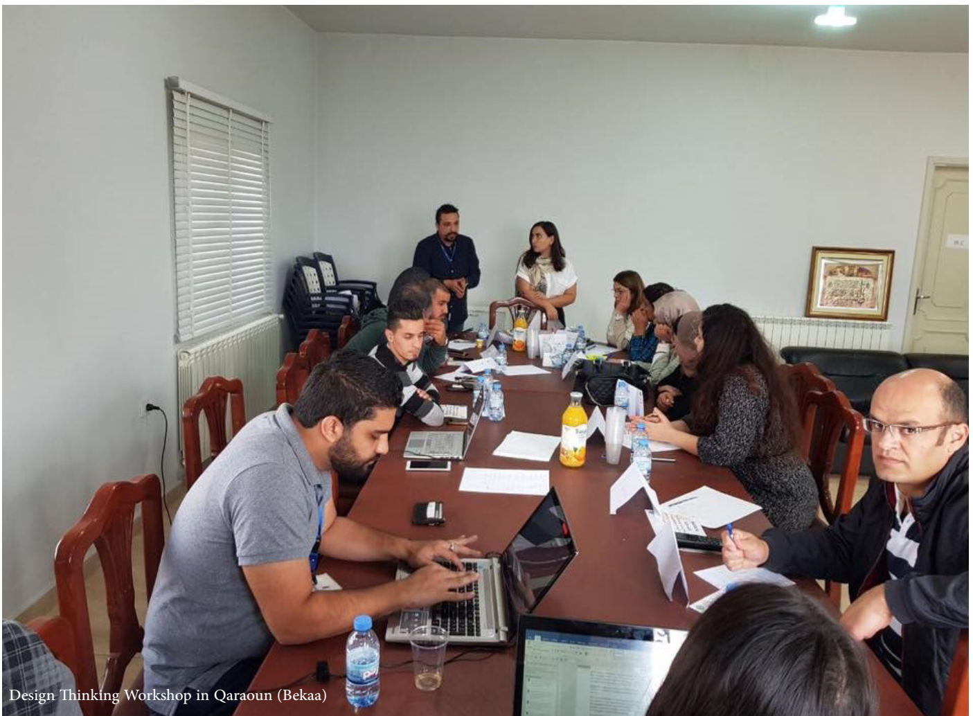
Design Thinking Workshop in Qaraoun (Bekaa)