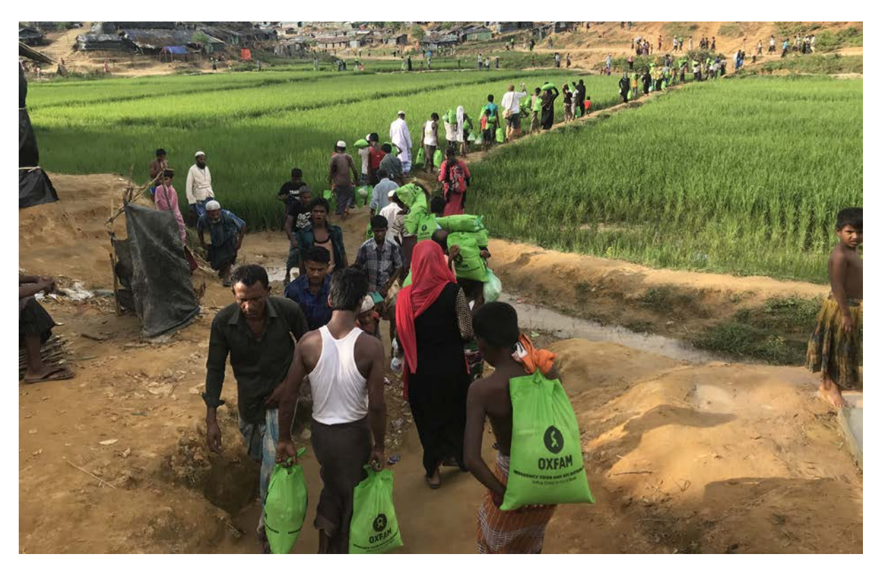
Refugees carry food parcels through Thengkhali Camp in Bangladesh.

Programming across the nexus will definitely involve trade-offs that teams will have to manage (see dilemma 3) according to context. In other words, the amount of focus and resources allocated to root causes in the spheres of development and peacebuilding may be smaller, equivalent to or greater than that allocated to the emergency response addressing the symptoms of crisis. Previously, decision-making in complex humanitarian crises had already involved recognizing red lines and managing humanitarian principles. Now, current operating contexts demand that Oxfam expand considerations to include development effectiveness standards (including accountable governance and democratic ownership) and peacebuilding (applying a conflict sensitivity lens at a minimum) to remain fit for purpose and meet its organisational mission.