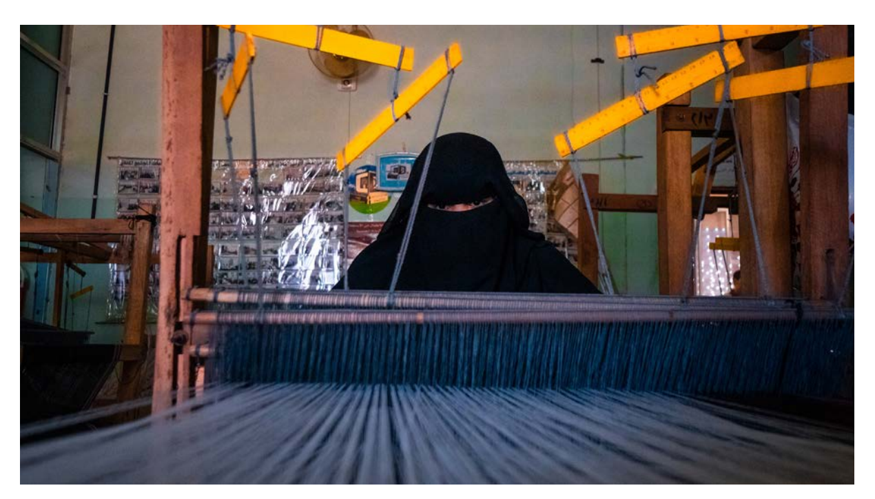
A Yemeni woman weaving cloth after receiving training and a grant to improve her livelihood.